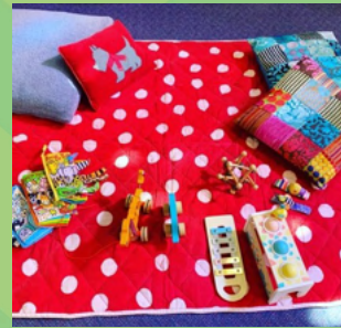
Mums and Bubs space

I have been in touch with other playgroup facilitators and they mention that weekend get-togethers seem to be more in keeping with what families and friends need. And so, for 2023 we will be trying out Signee Tots for the first Sunday of the month at JPC. I encourage all family members to come, because learning Auslan through play is not an opportunity that is widely available. For Signee Tots to continue we need your support and your attendance.