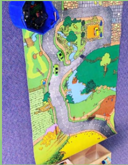
Travel and Transport

Signee Tots 2022 has been a rollercoaster of a year. We have the excitement of meeting new families, trying out new ways to get together and the dreaded winter illnesses spreading. After two years of COVID19 it is to be expected that there would be bumps along the ride and I thank the families and friends and children who've stuck it out with me.